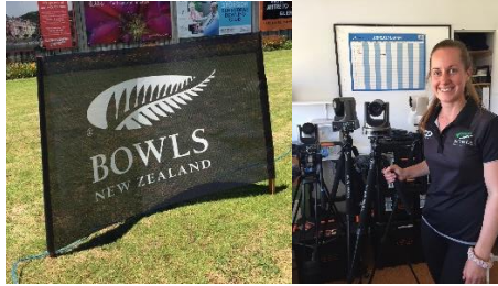
Bowls New Zealand set up for filming the Blind and Disabled National Tournament.