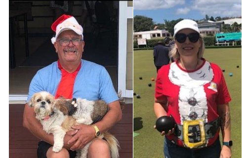
Our Christmas fun day!