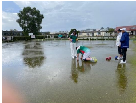
The conditions of play couldn't have been more different for the Blind and Disabled competition!