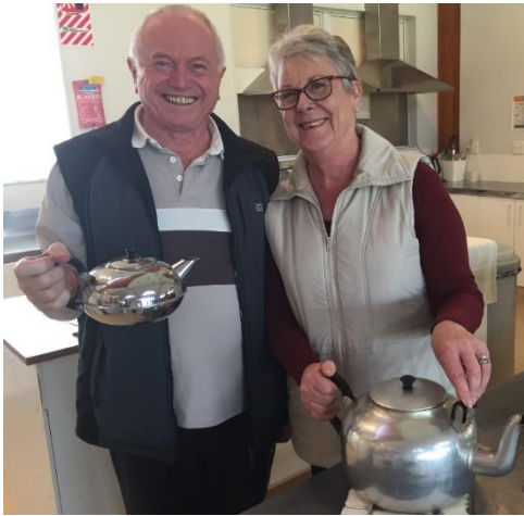
Two, not potty, tea pot pourers!

Don't forget to check into our Facebook page - Sunnybrae Bowling Club!